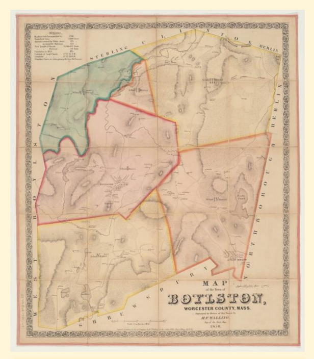
Figure 1 Map of Boylston School Districts, H. F. Walling 1856, Library of Congress

Last fall, invited by the Boylston Historical Museum, I set out to create a map of the town that would complement the Hastings Family of Boylston exhibit. It was the intention to locate as many of the family homes as we had information for. This required a good perusal of the Museum's map collection, where several maps were found to use as source material. These included the Map of Boylston , published by Fredrick W. Beers in 1870; an 1897 map produced by the Massachusetts Water Supply Commission defining properties to be taken by eminent domain for the flooding of the Wachusett Reservoir; the Historic Boylston map which is included in the 2012 edition of the Boylston Historical Series . Several map sources from outside the collection were also used, the Map of Boylston published by Henry F. Walling in 1856, several editions of the USGS maps for the area and of course the ubiquitous Google maps.